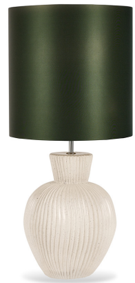
RILLE TABLE LAMP TL160 JASPER & POLISHED NICKEL WITH 13" TALL DRUM SHADE H: 43 cm (16.93") x D: 25.5 cm (10.04")