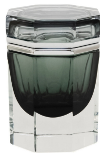
BRIOLETTE BOX-2 PETROL BLUE & CLEAR WITH POLISHED NICKEL H: 14 cm (5.51") x W: 10.5 cm (4.13") x D: 10.5 cm (4.13")