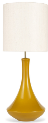
PYRUS TABLE LAMP TL162 MUSTARD & POLISHED BRASS WITH 13" TALL DRUM SHADE H: 56 cm (22.05") x D: 30 cm (11.81")