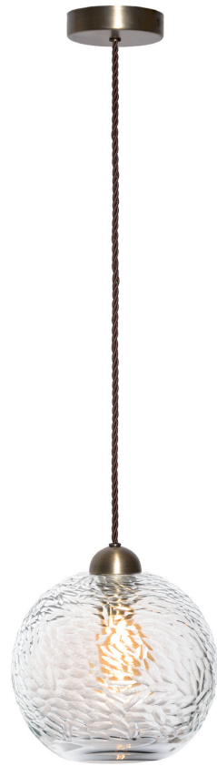
GLACIER PENDANT CL376 BATTUTO CLEAR & BRUSHED DARK BRONZE H: 20 cm (7.87") x D: 20 cm (7.87")

The finest quality English lead crystal is carved in a fashion that mimics the patterns etched into the weather beaten walls of glacial caves. Drawing on the Murano glass craft of 'Battuto' whose name itself derives from the Italian word for 'beaten', our Glacier pendant and table lamp have every facet carved out individually by our English crystal experts.