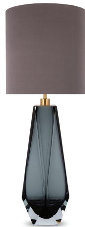
DIAMOND TABLE LAMP LARGE TL702 PETROL BLUE & CLEAR & BRUSHED GOLD WITH 11" TALL DRUM SHADE H: 59 cm (23.23") x D: 21 cm (8.27")