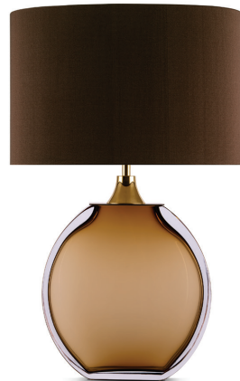
SOLITAIRE TABLE LAMP TL713-LA TOBACCO & CLEAR & POLISHED GOLD WITH 12" OVAL SHADE H: 40 cm (15.75") x W: 28 cm (11.02") x D: 10 cm (3.94")