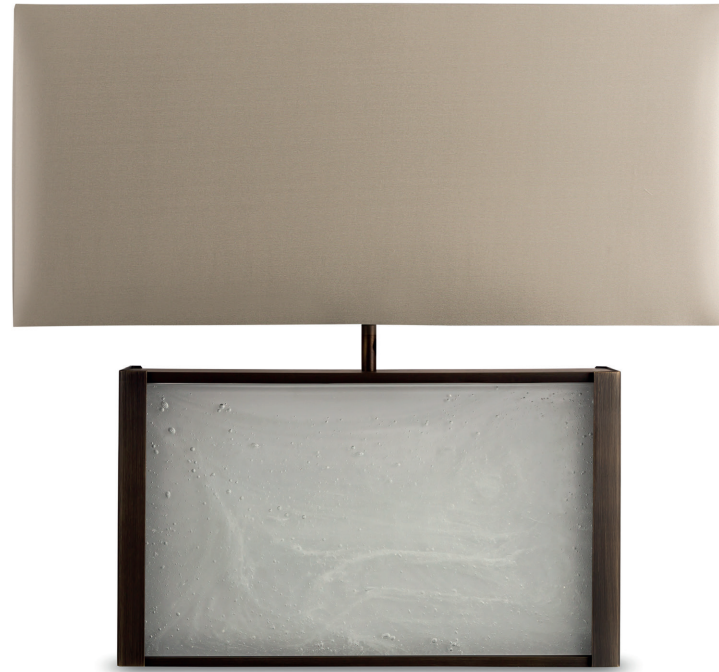
FACET TABLE LAMP TL550 DRY ICE & BRUSHED DARK BRONZE, WITH RECTANGULAR SHADE H: 35 cm (13.78") x W: 40 cm (15.75") x D: 7 cm (2.76")

The 'Dry Ice' glass encased within the solid frame of the Facet table Lamp is unlike others in our previous collections. With a hand-crafted smooth finish, the 'Dry Ice' glass brightens a room while adding a contemporary and elegant flair to any design. The detail of the glass finish when observed up close is captivating and creates a conversation around innovative craftsmanship and style.