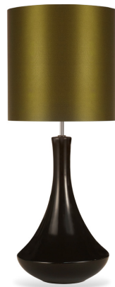
PYRUS TABLE LAMP TL162 BELUGA & POLISHED NICKEL WITH 13" TALL DRUM SHADE H: 56 cm (22.05") x D: 30 cm (11.81")