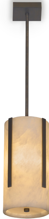
HERSCHEL PENDANT CL805-PEN ALABASTER & ANTIQUE BRUSHED BRASS H: 36 cm (14.17") x D: 18 cm (7.09")

The Herschel Pendant, inspired by the celestial wonders and named after the renowned astronomer William Herschel, is a captivating luminaire that stands as a beacon of astronomical beauty. Its sleek design and craftsmanship evoke a sense of wonder, reminiscent of distant galaxies and celestial bodies. With alabaster shades diffusing light softly, it creates a mesmerizing ambiance, commanding attention in any space. Each element of the pendant, from the precise placement of the shades to the sleek lines of the fixture, embodies sophistication and style.