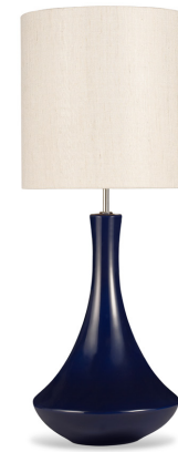
PYRUS TABLE LAMP TL162 ADMIRAL BLUE & POLISHED NICKEL WITH 13" TALL DRUM SHADE H: 56 cm (22.05") x D: 30 cm (11.81")