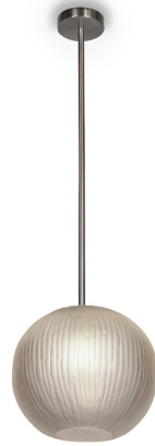
CYPRESS PENDANT CL236-PEN CLEAR & BRUSHED NICKEL H: 22 cm (8.66") x D: 27 cm (10.63")

Capturing the essence of the Mighty Bald Cypress tree, this pendant mirrors its regal shape and intricate root system. Hand-carved glass furrows, delicately acid dipped for a frosted effect, showcase nature's artistry. A luminary of understated style and captivating radiance, it brings enchantment to any illuminated space.