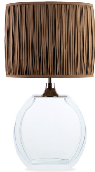
SOLITAIRE TABLE LAMP TL713-SM CLEAR & POLISHED NICKEL WITH 12" OVAL SHADE H: 34 cm (13.39") x W: 22 cm (8.66") x D: 10 cm (3.94")