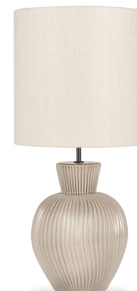
RILLE TABLE LAMP TL160 EARL GREY & OLD ENGLISH BRASS WITH 13" TALL DRUM SHADE H: 43 cm (16.93") x D: 25.5 cm (10.04")