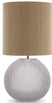
CYPRESS TABLE LAMP TL236 CLEAR & BRUSHED GOLD WITH 11" TALL DRUM SHADE H: 31 cm (12.2") x D: 27 cm (10.63")