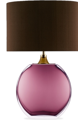
SOLITAIRE TABLE LAMP TL713-LA AMETHYST & CLEAR & POLISHED GOLD WITH 12" OVAL SHADE H: 40 cm (15.75") x W: 28 cm (11.02") x D: 10 cm (3.94")