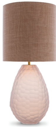
EYRE TABLE LAMP TL235 BLUSH PINK & BRUSHED GOLD WITH 11" TALL DRUM SHADE H: 37.5 cm (14.76") x W: 20.5 cm (8.07") x D: 16.5 cm (6.5")

Indigenously known as Kati-Thanda, Lake Eyre is typically dry, with its lakebed adorned by tessellating salt segments, a reflection captured in the scalloped surface of our Eyre table lamp. Among the five new colorways, Blush Pink stands out, emulating the natural phenomenon when the lake floods, introducing salt-loving algae and halobacterium that turn the waters a brilliant pink.