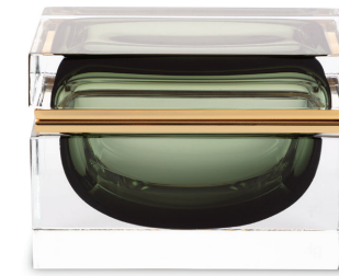
EMERALD BOX-4 FOREST GREEN & CLEAR WITH POLISHED GOLD H: 12 cm (4.72") x W: 18 cm (7.09") x D: 11 cm (4.33")