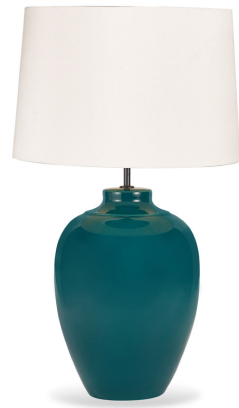
MELA TABLE LAMP TL163 DARK TEAL & BRONZE WITH 16" MELTON SHADE H: 48.5 cm (19.09") x D: 26 cm (10.24")