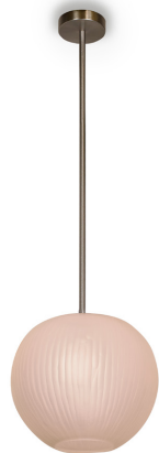
CYPRESS PENDANT CL236-PEN BLUSH PINK & BRUSHED NICKEL H: 22 cm (8.66") x D: 27 cm (10.63")