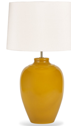
MELA TABLE LAMP TL163 MUSTARD & POLISHED BRASS WITH 16" MELTON SHADE H: 48.5 cm (19.09") x D: 26 cm (10.24")