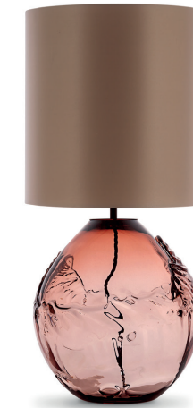
CREST TABLE LAMP TL238 TEA & BRUSHED DARK BRONZE WITH 12" TALL DRUM SHADE H: 37.5 cm (14.76") x D: 28 cm (11.02")

All the drama and energy of surging seas; crashing and whirling waves, frozen in their capricious path. A theatrical storm has been skillfully manipulated from molten glass, suspending this animated force of nature within a tempestuous capsule, each design in its fluid form.