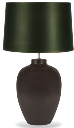
MELA TABLE LAMP TL163 BELUGA & POLISHED NICKEL WITH 16" MELTON SHADE H: 48.5 cm (19.09") x D: 26 cm (10.24")