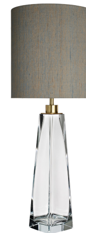
DIAMOND SQUARE OBELISK TABLE LAMP TL709 DIAMOND & CLEAR & BRUSHED GOLD WITH 11" TALL DRUM SHADE H: 43 cm (16.93") x D: 11.5 cm (4.53")