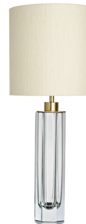
DIAMOND COLUMN TABLE LAMP SMALL TL704-SM CLEAR & BRUSHED GOLD WITH 10" TALL DRUM SHADE H: 43 cm (16.93") x D: 9 cm (3.54")