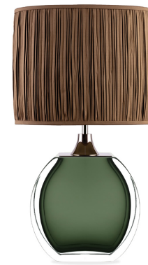
SOLITAIRE TABLE LAMP TL713-SM FOREST GREEN & CLEAR & POLISHED NICKEL WITH 12" OVAL SHADE H: 34 cm (13.39") x W: 22 cm (8.66") x D: 10 cm (3.94")