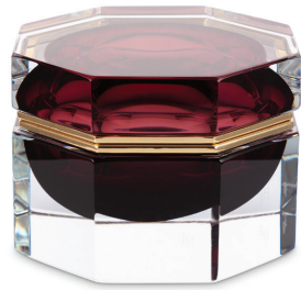
ASSCHER BOX-1 PETROL BLUE & CLEAR WITH POLISHED GOLD H: 11 cm (4.33") x W: 16.5 cm (6.5") x D: 16.5 cm (6.5")

Drawing inspiration from the resounding success of our Beverly Hills collection, the Carbon collection stands as a testament to the exceptional craftsmanship of our artisan glass masters. These breathtaking, ultra-contemporary accessories have been meticulously crafted for the most opulent interiors. Every item is handmade on the renowned island of Murano, utilizing four layers of glass and undergoing up to 12 hours of meticulous polishing for a flawless finish.