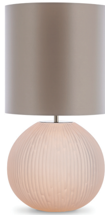
CYPRESS TABLE LAMP TL236 BLUSH PINK & BRUSHED NICKEL WITH 11" TALL DRUM SHADE H: 31 cm (12.2") x D: 27 cm (10.63")

The Giant Bald Cypress tree is of stalwart stature, rooted deep in the mangrove and keeping watch over an oasis of tranquility and stillness. The Cypress trees rotund form and complex root structure is emulated in our Cypress table lamp; an understated spherical piece with hand-carved glass furrows, acid dipped for an enchanting frosted look.