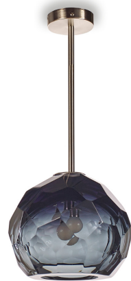
DIAMOND ROUND PENDANT CL710 TOBACCO & BRUSHED NICKEL H: 15.5 cm (6.1") x D: 19 cm (7.48")