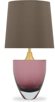
CHALICE TABLE LAMP TL714-SM AMETHYST & CLEAR & BRUSHED GOLD WITH 12" WALTON SHADE H: 31.5 cm (12.4") x D: 20 cm (7.87")