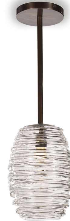
APOLLO PENDANT CL600 CLEAR & BRONZE H: 38.5 cm (15.16") x D: 22 cm (8.66")

Derived from the beloved Apollo Table Lamp, this pendant is a beautiful masterpiece delicately enveloped in a continuous, elegant glass thread. Each thread tells a story of craftsmanship and artistry, weaving a tale of timeless style that effortlessly enhances any space. Available in bronze or nickel metal finishes.