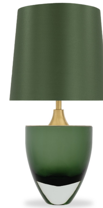
CHALICE TABLE LAMP TL714-SM FOREST GREEN & CLEAR & BRUSHED GOLD WITH 12" WALTON SHADE H: 31.5 cm (12.4") x D: 20 cm (7.87")