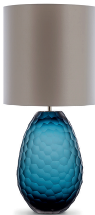
EYRE TABLE LAMP TL235 OCEAN BLUE & BRUSHED NICKEL WITH 11" TALL DRUM SHADE H: 37.5 cm (14.76") x W: 20.5 cm (8.07") x D: 16.5 cm (6.5")