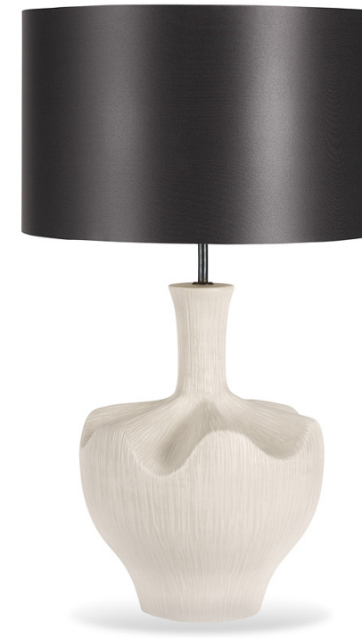
LILIUM TABLE LAMP TL161 GREY MARL & BRONZE WITH 16" SHORT DRUM SHADE H: 51 cm (20.08") x D: 30 cm (11.81")

The Liliium lamp, a ceramic creation, beautifully celebrates nature through its design inspired by the undulating seed pods of the Liliium flower genus. This table lamp possesses a curious and eccentric character that is bound to captivate your attention. Its flamboyant shape, wrapped in an understated off-white hue, adds an element of sophistication to any space.