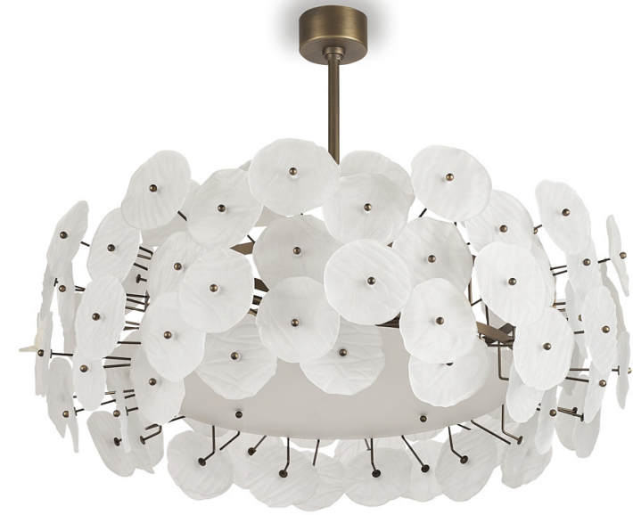
RUFFLE CHANDELIER CL207-5M SATIN & BRUSHED DARK BRONZE H: 42 cm (16.54") x D: 75 cm (29.53")

The Roaring Twenties brought a revolution in design, reflected in the flamboyant fashion of the era. Inspired by the extravagant dresses adorned with intricate beading and shimmering sequins, we present the smaller Ruffle ceiling light. Abundant with overlapping plates of gently waving satin glass and a spherical finial in your preferred finish, this design is perfect for yachts, adding a touch of glamour to any space.