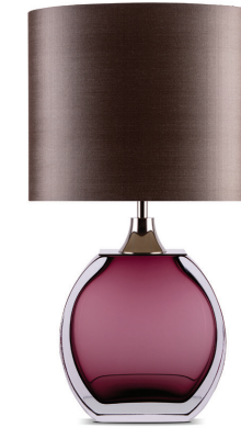
SOLITAIRE TABLE LAMP TL713-SM AMETHYST & CLEAR & POLISHED NICKEL WITH 12" OVAL SHADE H: 34 cm (13.39") x W: 22 cm (8.66") x D: 10 cm (3.94")

A stunning new table lamp, which is from the same Italian artisan makers of our weighty Diamond lamps. Flawless, pristine polished Murano glass, which are mould made so that they are perfect every time, they are formed from four layers of glass in our core Beverly Hills collection colours. Available in two sizes, these lamp bases are slim, which makes them perfect for console and bedside tables.