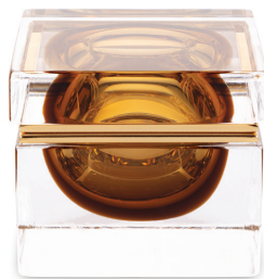
PRINCESS BOX-3 TOBACCO & CLEAR WITH POLISHED GOLD H: 12 cm (4.72") x W: 13 cm (5.12") x D: 13 cm (5.12")