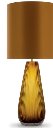
TUPELO TABLE LAMP TL237 AMBER & BRUSHED GOLD WITH 12" TALL DRUM SHADE H: 45 cm (17.72") x D: 17 cm (6.69")

The Tupelo tree, a majestic sentinel by the water's edge, stands tall with its ancient presence and distinctive cragged, banded bark. Our Tupelo table lamp pays homage, adorned in a coat of chiseled grooves that mirror the bark of these monumental trees. Our Tupelo lamps are handmade in the UK, slight variations in dimension and appearance may occur from piece to piece.