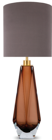
DIAMOND TABLE LAMP LARGE TL702 TOBACCO & CLEAR & BRUSHED GOLD WITH 11" TALL DRUM SHADE H: 59 cm (23.23") x D: 21 cm (8.27")