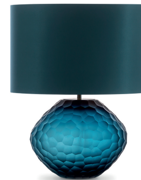
ATACAMA TABLE LAMP TL234 OCEAN BLUE & BRUSHED NICKEL WITH 15" OVAL DRUM SHADE H: 27.5 cm (10.83") x W: 27 cm (10.63") x D: 22 cm (8.66")