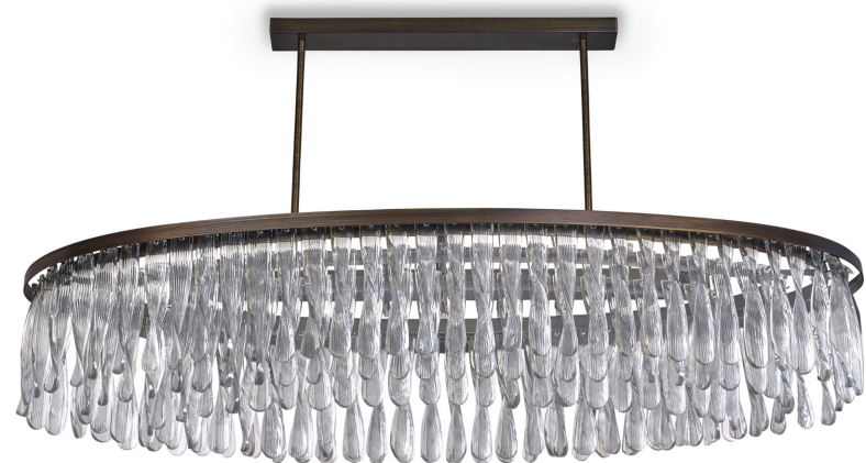
TRIPLE OVAL RIBBON CHANDELIER CL464-3T-O-160 CLEAR & ANTIQUE BRUSHED BRASS H: 34.4 cm (13.54") x W: 160 cm (62.99") x D: 60 cm (23.62")

The Triple Oval Ribbon Chandelier is our latest addition to the Retro Murano ribbon chandelier range. The ornate and striking glass ribbons made with Murano glass create the illusion of cascading water, adding grandeur and character to any room.