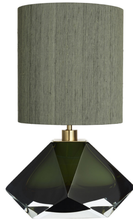
DIAMOND TABLE LAMP SMALL TL700 FOREST GREEN & CLEAR & BRUSHED GOLD WITH 11" TALL DRUM SHADE H: 26 cm (10.24") x W: 34 cm (13.39") x D: 19 cm (7.48")

Our exclusive collection of ultra-contemporary Murano glass table lamps are perfect for the most luxurious interiors. Crafted by the finest glass masters in Murano, our small Diamond lamps draw inspiration from Art Deco perfume bottles. Meticulously made from four layers of glass and polished by hand for up to 12 hours to achieve perfection. French wired with silk flex in coordinating colors, these table lamps are as exquisite as they are functional.