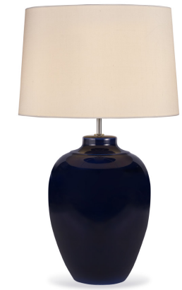
MELA TABLE LAMP TL163 ADMIRAL BLUE & POLISHED NICKEL WITH 16" MELTON SHADE H: 48.5 cm (19.09") x D: 26 cm (10.24")