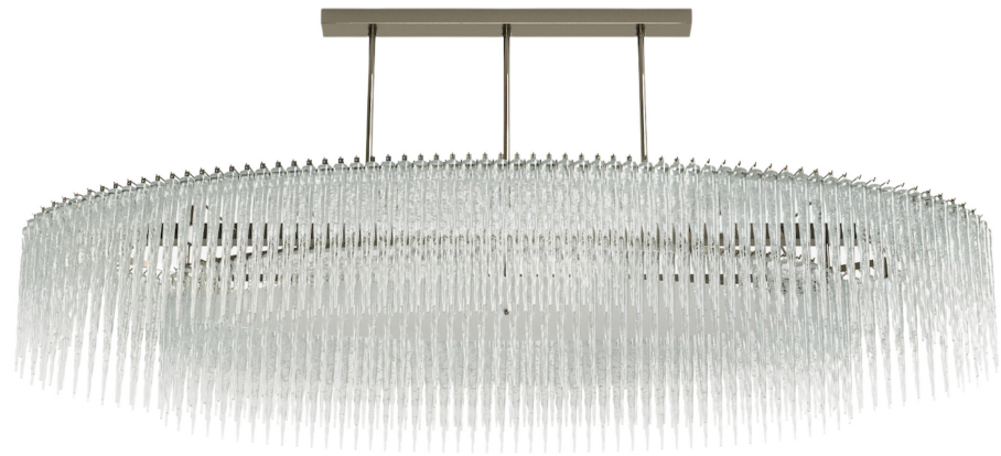
ICE OVAL CHANDELIER CL800-O-200 CLEAR & BRUSHED NICKEL H: 42 cm (16.54") x W: 200 cm (62.99") x D: 80 cm (23.62")

Elevate your space with our Ice Oval Chandelier, a reinvented masterpiece from the cherished Vega Collection. This two-tiered marvel showcases suspended glass pendants in swirling layers, evoking a profound sense of tranquility and serenity. Experience a celestial dance of light and glass, as the Ice Oval Chandelier graces your space with cosmic splendor. A timeless classic, infuse your surroundings with a celestial aura.