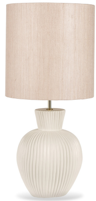
RILLE TABLE LAMP TL160 CHALK & POLISHED BRASS WITH 13" TALL DRUM SHADE H: 43 cm (16.93") x D: 25.5 cm (10.04")

Named after the term introduced by German astronomer Johann Schroter, "Rille" describes the channels scored into the moon's surface. The lamp's exaggerated furrows create a captivating interplay between light and dark, enhanced by four new glazes.