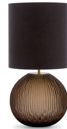
CYPRESS TABLE LAMP TL236 BRONZE & BRUSHED GOLD WITH 11" TALL DRUM SHADE H: 31 cm (12.2") x D: 27 cm (10.63")