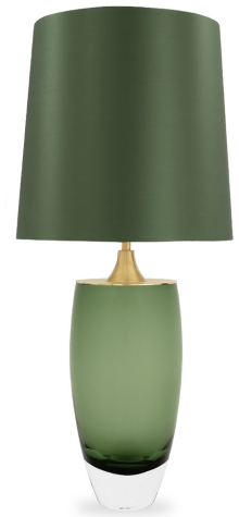
CHALICE TABLE LAMP TL714-LA FOREST GREEN & CLEAR & BRUSHED GOLD WITH 12" WALTON SHADE H: 49.5 cm (19.49") x D: 18 cm (7.09")