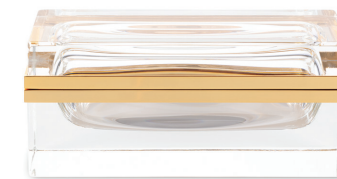
MARQUISE BOX-5 CLEAR WITH POLISHED GOLD H: 10 cm (3.94") x W: 24 cm (9.45") x D: 10 cm (3.94")