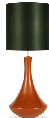
PYRUS TABLE LAMP TL162 TABASCO & POLISHED BRASS WITH 13" TALL DRUM SHADE H: 56 cm (22.05") x D: 30 cm (11.81")