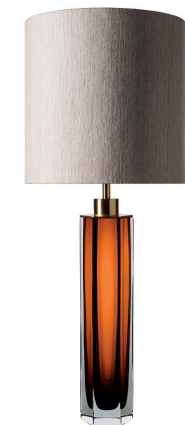
DIAMOND COLUMN TABLE LAMP SMALL TL704-SM TOBACCO & CLEAR & BRUSHED GOLD WITH 10" TALL DRUM SHADE H: 43 cm (16.93") x D: 9 cm (3.54")