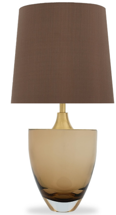
CHALICE TABLE LAMP TL714-SM TOBACCO & CLEAR & BRUSHED GOLD WITH 12" WALTON SHADE H: 31.5 cm (12.4") x D: 20 cm (7.87")