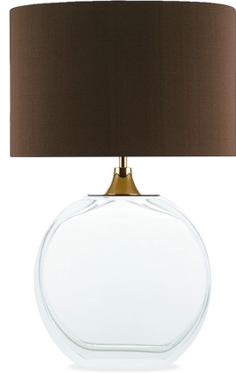
SOLITAIRE TABLE LAMP TL713-LA CLEAR & POLISHED GOLD WITH 12" OVAL SHADE H: 40 cm (15.75") x W: 28 cm (11.02") x D: 10 cm (3.94")