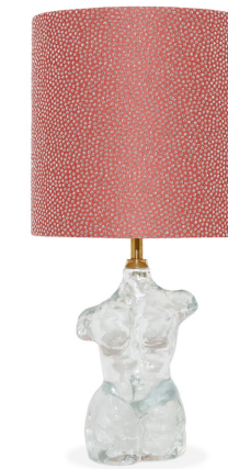
VENUS TABLE LAMP TL814 CLEAR & POLISHED BRASS WITH 9" TALL DRUM SHADE H: 28.5 cm (11.22") x W: 13 cm (5.12") x D: 8.5 cm (3.35")