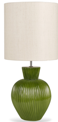
RILLE TABLE LAMP TL160 IVY & POLISHED NICKEL WITH 13" TALL DRUM SHADE H: 43 cm (16.93") x D: 25.5 cm (10.04")