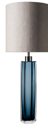
DIAMOND COLUMN TABLE LAMP SMALL TL704-SM PETROL BLUE & CLEAR & BRUSHED NICKEL WITH 10" TALL DRUM SHADE H: 43 cm (16.93") x D: 9 cm (3.54")

Uncover the essence of enduring sophistication with our Diamond Column table lamp. Meticulously crafted with exquisite Murano glass, this classic design features six sides and is available in two sizes and five captivating colors, allowing you to customise your space with timeless style.