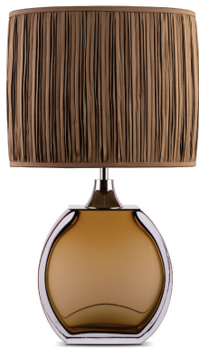
SOLITAIRE TABLE LAMP TL713-SM TOBACCO & CLEAR & POLISHED NICKEL WITH 12" OVAL SHADE H: 34 cm (13.39") x W: 22 cm (8.66") x D: 10 cm (3.94")