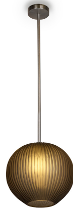
CYPRESS PENDANT CL236-PEN BRONZE & BRUSHED NICKEL H: 22 cm (8.66") x D: 27 cm (10.63")