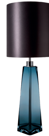
DIAMOND SQUARE OBELISK TABLE LAMP TL709 PETROL BLUE & CLEAR & BRUSHED NICKEL WITH 11" TALL DRUM SHADE H: 43 cm (16.93") x D: 11.5 cm (4.53")

The Square Obelisk table lamp, draws inspiration from the iconic architectural structure. It features a tall, four-sided design with a narrow tapering profile that culminates in a pyramid-like shape at the top. Historically, obelisks were erected as monuments or landmarks, notably in ancient Egypt and other civilisations, symbolising power and commemorating significant events, individuals, or locations.