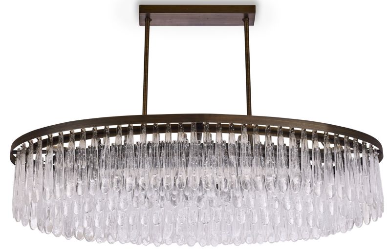
TRIPLE OVAL DROPLET CHANDELIER CL463-3T-O-120 CLEAR & ANTIQUE BRUSHED BRASS H: 28.5 cm (11.22") x W: 120 cm (47.24") x D: 50 cm (19.69")

Discover the latest innovation: The Triple Oval Droplet Chandelier is adorned with exquisite clear and smoke marble-effect glass scallop droplets, handcrafted from authentic Murano glass, this chandelier is a sight to behold. Choose from a palette of three brushed metal finishes that perfectly match your aesthetic.