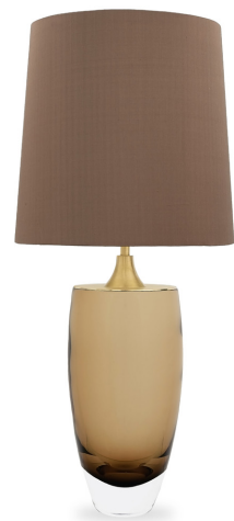
CHALICE TABLE LAMP TL714-LA TOBACCO & CLEAR & BRUSHED GOLD WITH 12" WALTON SHADE H: 49.5 cm (19.49") x D: 18 cm (7.09")