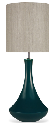
PYRUS TABLE LAMP TL162 DARK TEAL & BRONZE WITH 13" TALL DRUM SHADE H: 56 cm (22.05") x D: 30 cm (11.81")

The fruit from the tree of the Pyrus genus is the humble pear, the perfect name for our latest ceramic design. Curvaceous but sleek, our Pyrus lamp renews this classic pear shape, creating a chic outline for superior interior styling. Illuminated in six new glossy glazes, this piece is as versatile as it is vivacious.