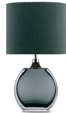
SOLITAIRE TABLE LAMP TL713-SM PETROL BLUE & CLEAR & POLISHED NICKEL WITH 12" OVAL SHADE H: 34 cm (13.39") x W: 22 cm (8.66") x D: 10 cm (3.94")