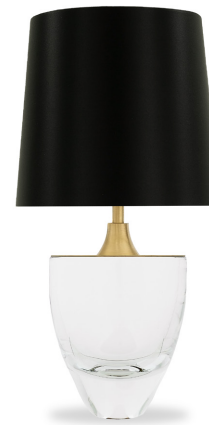
CHALICE TABLE LAMP TL714-SM CLEAR & BRUSHED GOLD WITH 12" WALTON SHADE H: 31.5 cm (12.4") x D: 20 cm (7.87")

Another stunning addition to the Beverly Hills range, this hand formed Murano glass piece resembles an opulent Chalice. Carefully polished for up to 12 hours, the shape and unrivalled quality of Murano glass allows the light to refract and highlight the deep, rich tones of our core colourways.