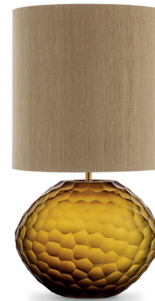
ATACAMA TABLE LAMP TL234 AMBER & BRUSHED GOLD WITH 11" TALL DRUM SHADE H: 27.5 cm (10.83") x W: 27 cm (10.63") x D: 22 cm (8.66")

Atacama, Chile, one of the driest places on Earth, holds an ethereal beauty with an otherworldly landscape. Picture pink birds, mysterious pockets of water, and jets of steam in this remote desert. Most captivating is the vast white jigsaw of the Atacama salt flats. Our new design, sharing the same name, echoes the natural pattern of this salt mosaic in a delightful array of glass colors.