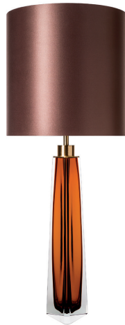
DIAMOND OBELISK TABLE LAMP TL708 TOBACCO & CLEAR & BRUSHED GOLD WITH 11" TALL DRUM SHADE H: 49 cm (19.29") x D: 10 cm (3.94")

Our exquisite Diamond Obelisk table lamps are inspired by ancient Egyptians, who placed pairs of obelisks at the entrance of their temples. This stunning piece is a fusion elegance and modern design, featuring a sleek obelisk silhouette that exudes sophistication. Crafted to perfection by skilled artisans. Elevate your decor with the enchanting beauty of Murano glass and illuminate your space with the unparalleled brilliance of the Diamond Obelisk table lamp.