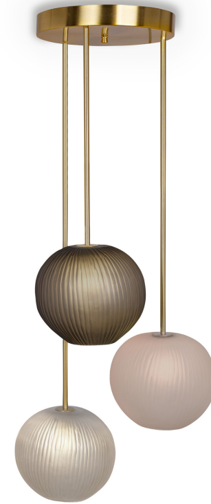
CYPRESS CLUSTER CL236-PEN-3 BLUSH PINK, BRONZE, CLEAR & BRUSHED GOLD H: 22 cm (8.66") x D: 27 cm (10.63")

Introducing the Cypress Pendant Cluster, this fixture embodies strength and serenity with rounded forms, hand-carved glass, and a captivating frosted effect. More than a lighting piece, it's a work of art that brings nature's tranquility into your space. Whether above a table or in a cozy corner, it radiates timeless beauty and invites you to bask in its serene glow.