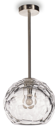
DIAMOND ROUND PENDANT CL710 CLEAR & BRUSHED NICKEL H: 15.5 cm (6.1") x D: 19 cm (7.48")

This elegant, faceted ball shaped pendant allows light to refract, creating a beautiful honeycomb pattern. Handcrafted from layered Murano glass and meticulously polished for up to 12 hours, each piece is a one-of-a-kind exemplar of unrivalled quality.