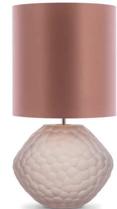
ATACAMA LAMP TL234 BLUSH PINK & BRUSHED NICKEL WITH 11" TALL DRUM SHADE H: 27.5 cm (10.83") x W: 27 cm (10.63") x D: 22 cm (8.66")