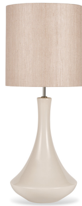
PYRUS TABLE LAMP TL162 PARCHMENT & POLISHED NICKEL WITH 13" TALL DRUM SHADE H: 56 cm (22.05") x D: 30 cm (11.81")