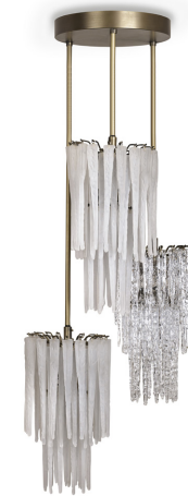
ICE PENDANT CL800-PEN-3 CLEAR, SATIN & BRUSHED DARK BRONZE H: 47.5 cm (18.7") x D: 25 cm (9.84")