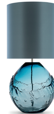
CREST TABLE LAMP TL238 OCEAN BLUE & BRUSHED NICKEL WITH 12" TALL DRUM SHADE H: 37.5 cm (14.76") x D: 28 cm (11.02")