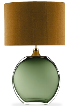
SOLITAIRE TABLE LAMP TL713-LA FOREST GREEN & CLEAR & POLISHED GOLD WITH 12" OVAL SHADE H: 40 cm (15.75") x W: 28 cm (11.02") x D: 10 cm (3.94")