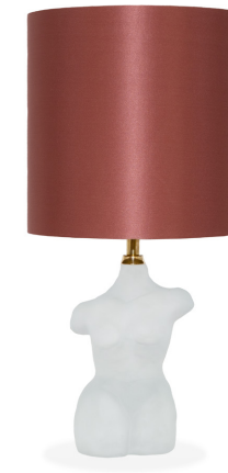
VENUS TABLE LAMP TL814 FROSTED & POLISHED BRASS WITH 9" TALL DRUM SHADE H: 28.5 cm (11.22") x W: 13 cm (5.12") x D: 8.5 cm (3.35")

Goddess of love and beauty, Venus encompasses femininity and will bring a graceful presence to your interior setting. This refined sculpture is honed from solid Italian glass and embellished with brass fixings. We offer Venus in clear glass for a gentler aura or a satin finish which echoes the glowing presence of her namesake planet, the brightest object in our night sky beyond the Moon, a true object of desire.