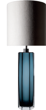
DIAMOND COLUMN TABLE LAMP LARGE TL704-LA PETROL BLUE & CLEAR & BRUSHED NICKEL WITH 12" TALL DRUM SHADE H: 50 cm (19.69") x D: 11 cm (4.33")