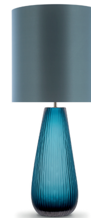
TUPELO TABLE LAMP TL237 OCEAN BLUE & BRUSHED NICKEL WITH 12" TALL DRUM SHADE H: 45 cm (17.72") x D: 17 cm (6.69")