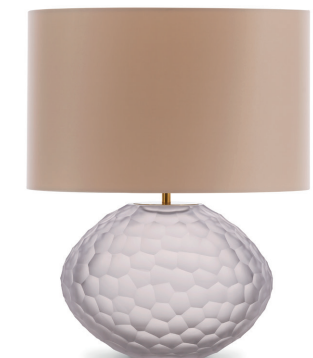
ATACAMA LAMP TL234 CLEAR & BRUSHED GOLD WITH 15" OVAL DRUM SHADE H: 27.5 cm (10.83") x W: 27 cm (10.63") x D: 22 cm (8.66")