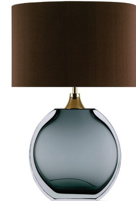
SOLITAIRE TABLE LAMP TL713-LA PETROL BLUE & CLEAR & POLISHED GOLD WITH 12" OVAL SHADE H: 40 cm (15.75") x W: 28 cm (11.02") x D: 10 cm (3.94")