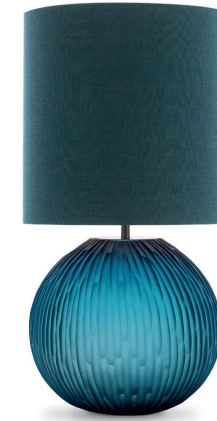
CYPRESS TABLE LAMP TL236 OCEAN BLUE & BRUSHED NICKEL WITH 11" TALL DRUM SHADE H: 31 cm (12.2") x D: 27 cm (10.63")