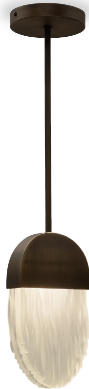
CLAIR DE LUNE PENDANT CLZ11-OVAL SATIN & BRUSHED DARK BRONZE H: 32.8 cm (12.91") x D: 16.2 cm (6.38")

The classic romantic image of the moon illuminating rippled water. We developed a way of melting, fusing and shaping the perfect 3D illustration of this scene in glass. The undulations in the glass appear to sway and pulse as the light hits the frozen waves, all clasped by understated, sleek metalwork to keep your eyes undistracted from the play of light within. To preserve the image as we imagined, the glass is solely available in a Satin finish but the metal details can be created in a number of our house finishes; brushed gold, brushed nickel or brushed dark bronze to subtly adapt the look of these distinctive designs.