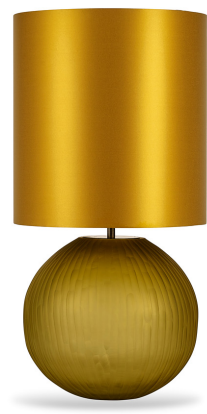
CYPRESS TABLE LAMP TL236 AMBER & ANTIQUE BRUSHED BRASS WITH 11" TALL DRUM SHADE H: 31 cm (12.2") x D: 27 cm (10.63")