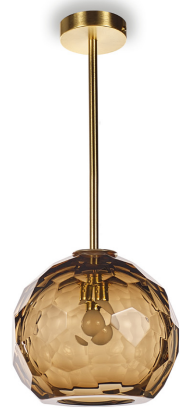
DIAMOND ROUND PENDANT CL710 PETROL BLUE & BRUSHED GOLD H: 15.5 cm (6.1") x D: 19 cm (7.48")