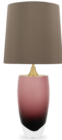
CHALICE TABLE LAMP TL714-LA AMETHYST & CLEAR & BRUSHED GOLD WITH 12" WALTON SHADE H: 49.5 cm (19.49") x D: 18 cm (7.09")