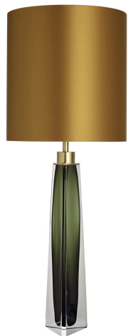
DIAMOND OBELISK TABLE LAMP TL708 FOREST GREEN & CLEAR & BRUSHED GOLD WITH 11" TALL DRUM SHADE H: 49 cm (19.29") x D: 10 cm (3.94")