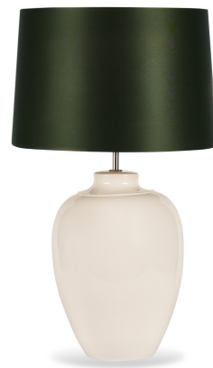
MELA TABLE LAMP TL163 PARCHMENT & POLISHED NICKEL WITH 16" MELTON SHADE H: 48.5 cm (19.09") x D: 26 cm (10.24")