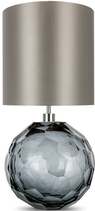
DIAMOND ROUND TABLE LAMP LARGE TL710 PETROL BLUE & CLEAR & BRUSHED NICKEL WITH 12" TALL DRUM SHADE H: 36 cm (14.17") x D: 28.5 cm (11.22")

Distinguished by its exquisite round ball-shaped design. Crafted from layers of Murano Glass and meticulously hand-polished for up to 12 hours, this lamp exudes sophistication and timeless beauty. Its unique spherical form commands attention and makes it the perfect statement piece for any room. Illuminate your space with sophistication and elevate your interior décor with the understated charm of our round ball-shaped lamp.