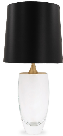
CHALICE TABLE LAMP TL714-LA CLEAR & BRUSHED GOLD WITH 13" TALL DRUM SHADE H: 49.5 cm (19.49") x D: 18 cm (7.09")