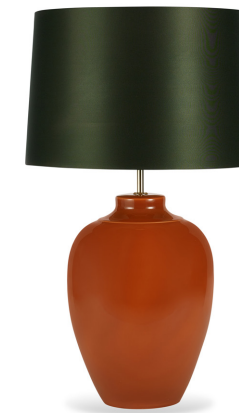
MELA TABLE LAMP TL163 TABASCO & POLISHED BRASS WITH 16" MELTON SHADE H: 48.5 cm (19.09") x D: 26 cm (10.24")

The Mela table lamp, which takes its name from the Italian word for 'apple', is a rejuvenation of the traditional urn shape with six new finishes to adorn its voluptuous form. This creation is truly the apple of our eye.