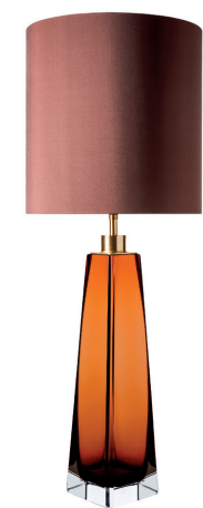
DIAMOND SQUARE OBELISK TABLE LAMP TL709 TOBACCO & CLEAR & BRUSHED GOLD WITH 11" TALL DRUM SHADE H: 43 cm (16.93") x D: 11.5 cm (4.53")